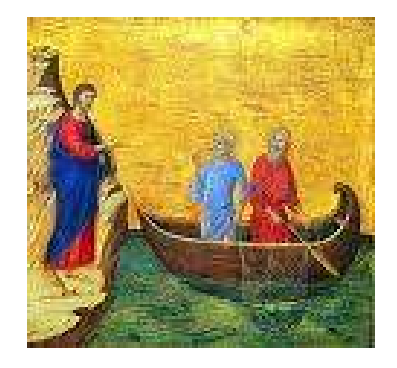
As of old, St. Andrew heard it by the Galilean lake . . .

December 13 next deadline Note: the second Friday this month